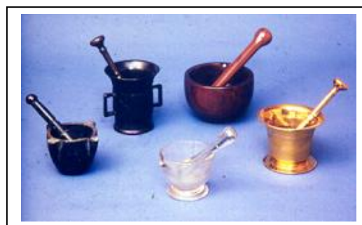
Selection of mortars in different materials.

People have used mortars for many centuries to grind or mix food and drugs. They probably started as a small hollow in a rock. The Papyrus Ebers (a famous Egyptian document listing remedies or “cures” for many diseases, infections, and accidents) mentions a mortar as early as 1552 B.C. By the 1600s they had become an essential household item for grinding foods. Artisans also used them for grinding dyes, and chemists & druggists used them for preparing medicines.