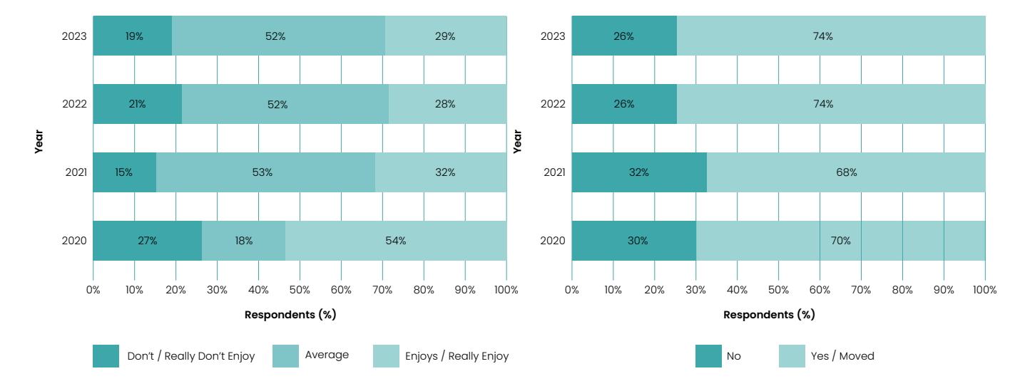
Figure 3: Respondents' rating of their work enjoyment on a day-to-day basis, compared year-on-year (2020 to 2023). Samples do not include those who are not currently working / studying or those who selected "Prefer not to say", "Not applicable", or equivalents. The reduced samples for each year are: 2020, n=947; 2021, n=986; 2022, n=1,428; 2023, n=1,177.

• Over half of the 2023 sample (52%) reported that they enjoy some aspects of their work or study on a day-to-day basis; 29% reported they enjoy / really enjoy their work on a day-to-day basis and only 19% reportedly don't / really don't enjoy their work (Figure 3) In comparison, International (including Northern Ireland) respondents were, generally, more positive, with 52% reporting that they enjoy / really enjoy their work on a daily basis.